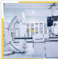
Fully Equipped Cath Lab