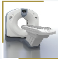
Advanced CT Scan for Minimum Radiation Levels