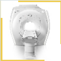
Silent MRI 1.5T